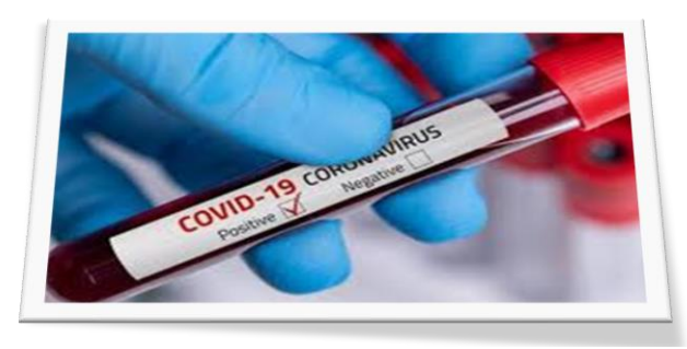
Figure 1- One of the scary images associated with Covid_19

The appearance of this virus, easily contagious, which is transmitted by fluids, secretions and aerosols, radically altered life in society and inherently the work of firefighters.